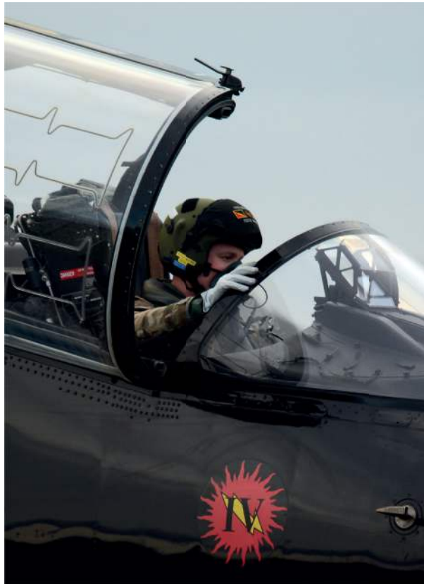
Figure 4: An aircraft canopy