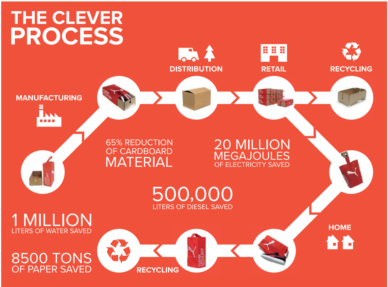
Figure 8: A graphic illustrating the manufacturing process of Clever Little Bags

[Source: images and details with kind permission from fuseproject]