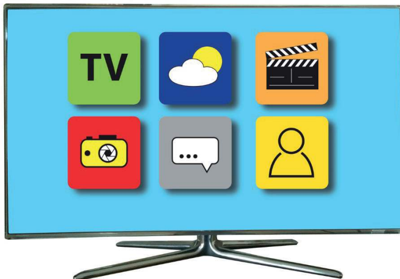
Figure 2: An internet-ready television

What is an internet-ready television an example of?