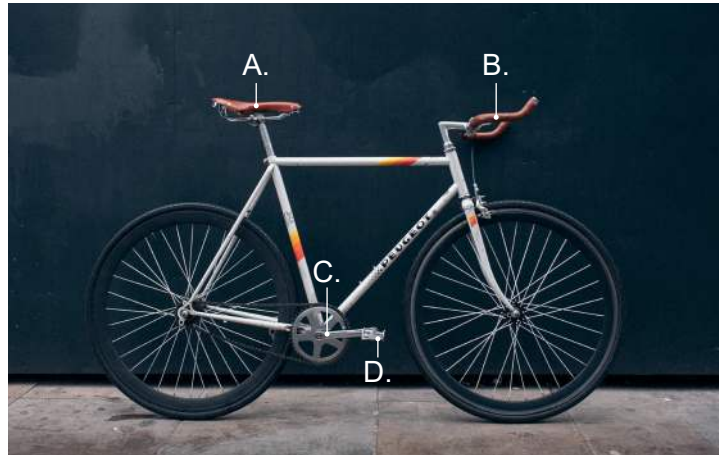
Figure 1: A bicycle