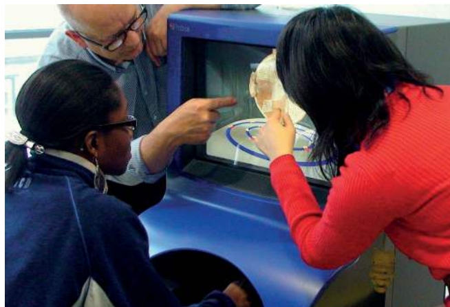
Figure 3: People interacting with an exhibit in a museum