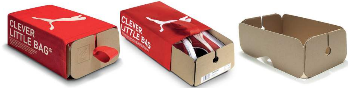
Figure 7: An example of the Puma Clever Little Bag